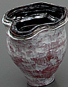
Safe Space (2020) Clay fired and unfired, glaze, acrylic, foam 2 x 120 x 50 x 6 cm