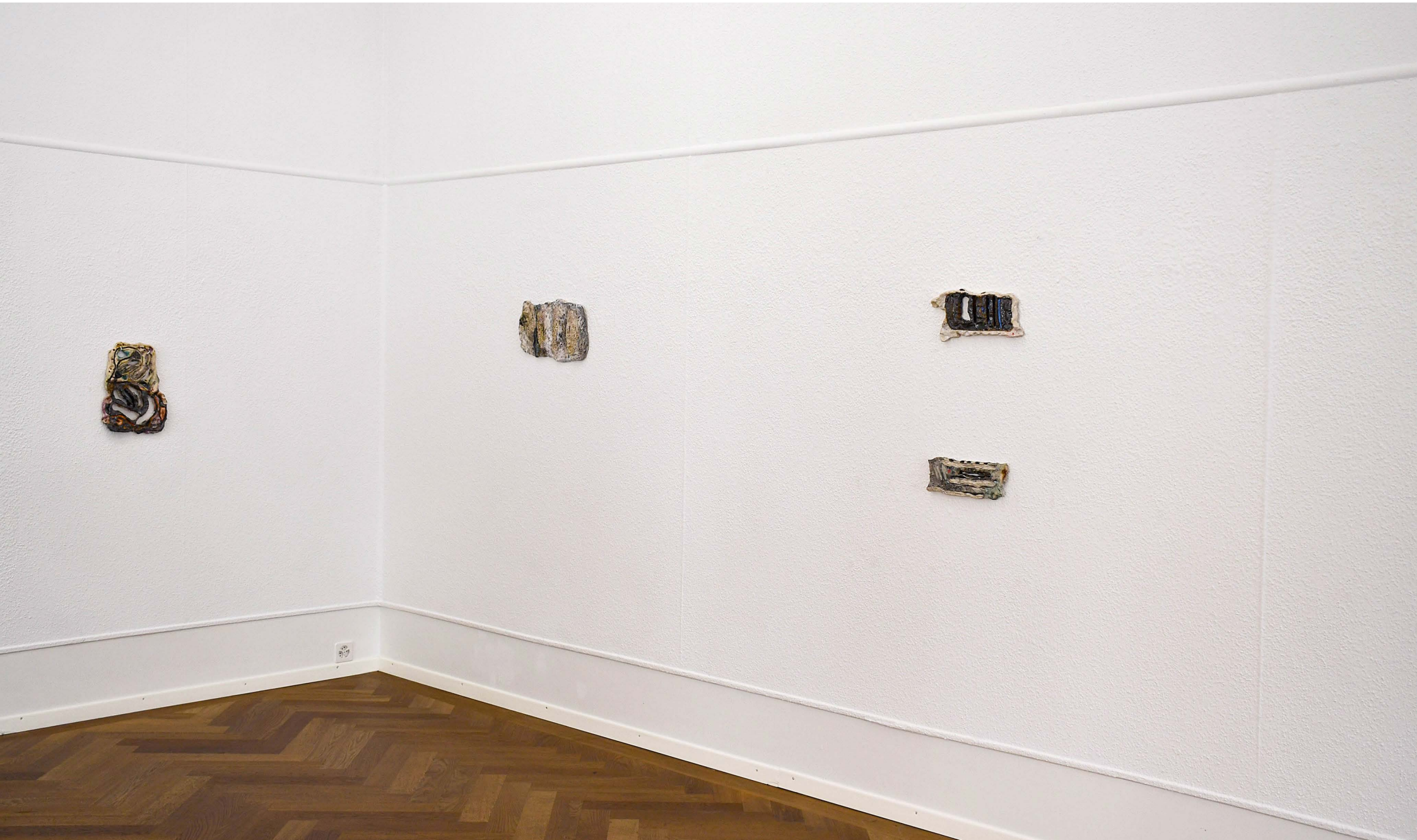
The Feeling Is Mutual (2023) Glaze on ceramics, acrylic 24 x 13 x 1 cm