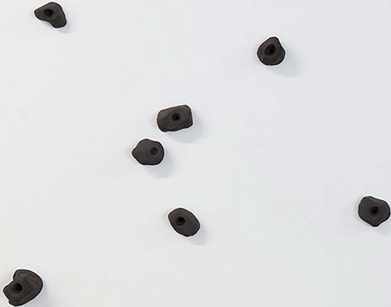
Zimmermannhaus 2022