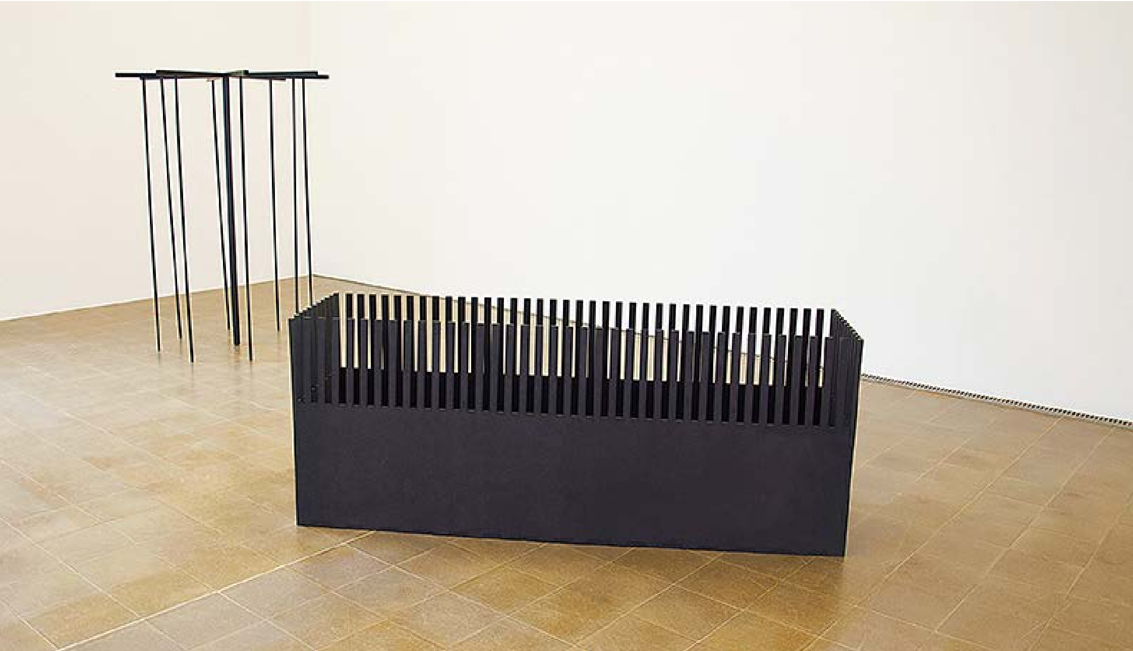
Schaumkörper(2020) Foam 190 x 75 x 45 cm