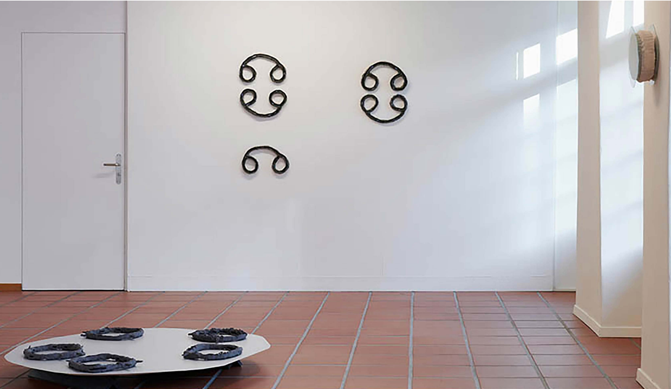
Zimmermannhaus 2022

Off_Set I (2022) Foam, glass, glue, acrylic 28 x 28 x 10 cm