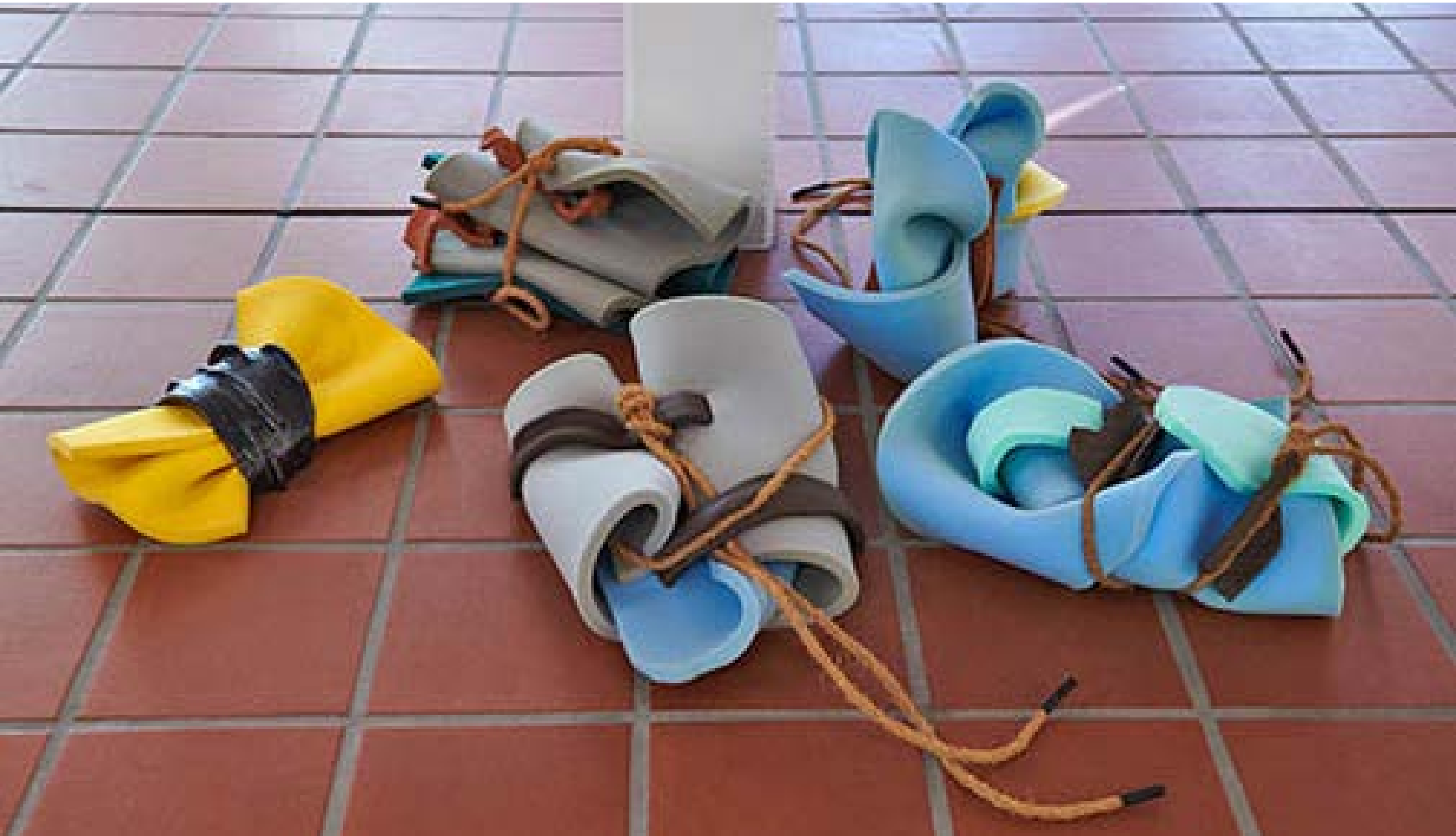
Zimmermannhaus 2022

As If We Were One I-VI (2021) Ceramic, glaze, rope, foam, plastic 40 x 75 x 20 cm