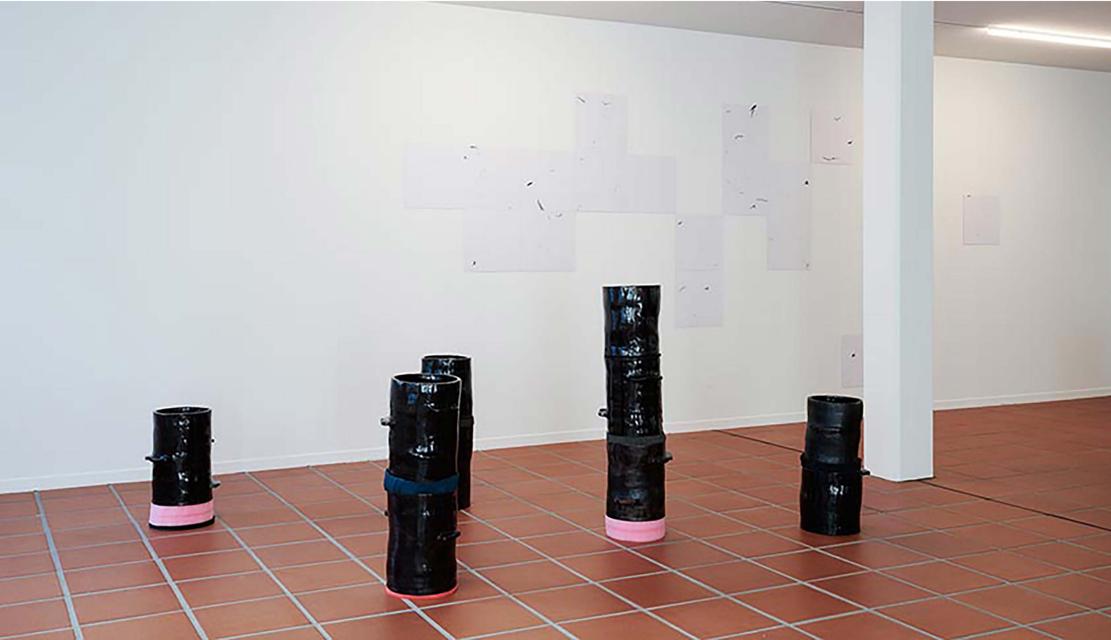
Zimmermannhaus 2022

Cylinder (2022) Ceramic, glaze, foam 4 x 23 x 65 cm, 23 x 120 cm (dimension variable)