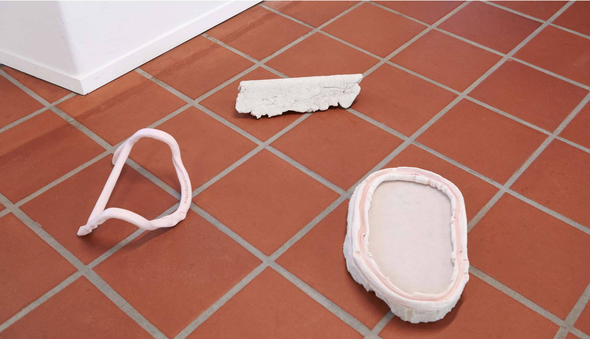
Zimmermannhaus 2022

Schaum (2022) Ceramic, glaze, foam, acrylic paint 40 x 8 x 30 cm